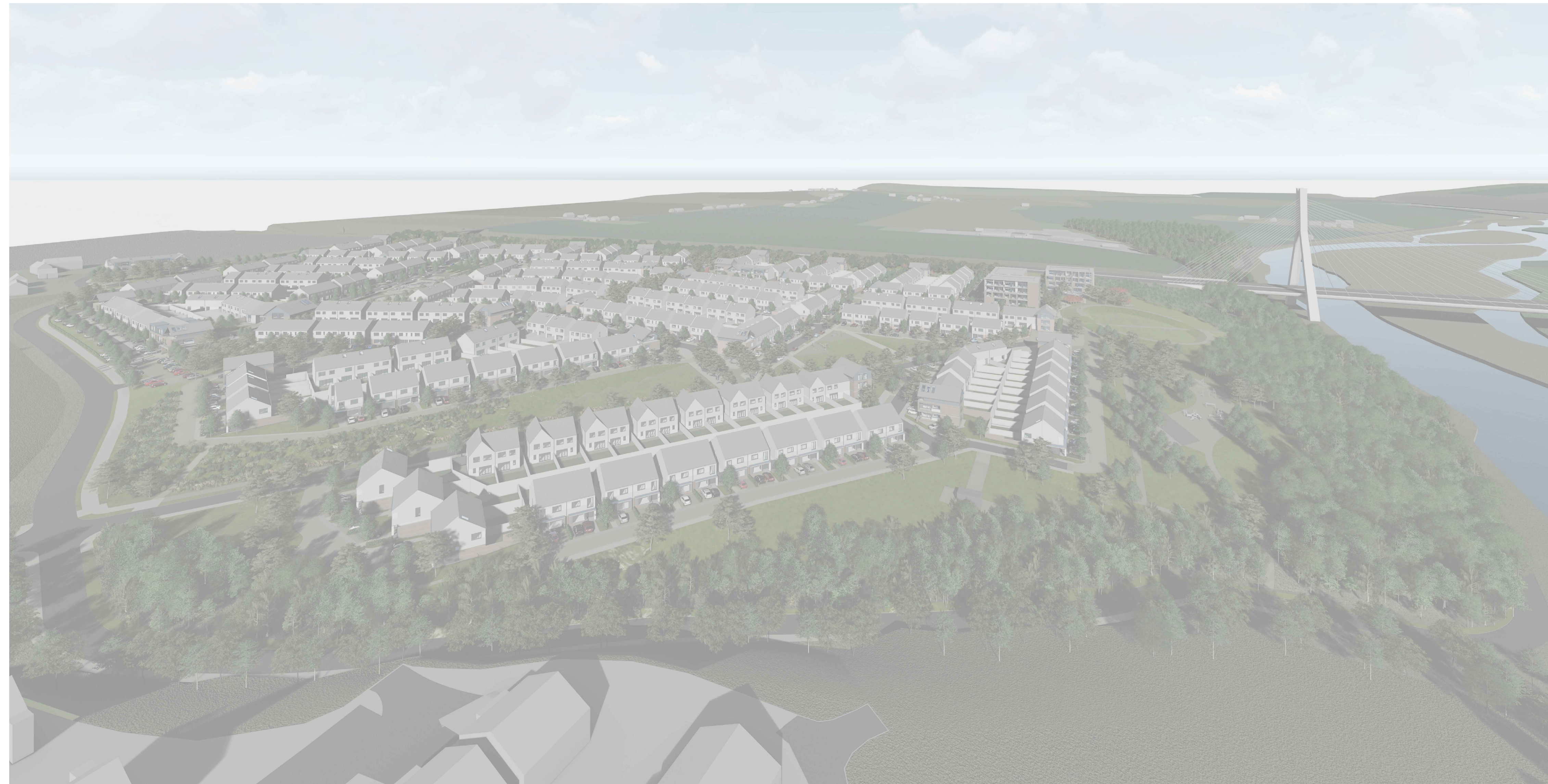
SITE VIEW FROM NORTH EAST