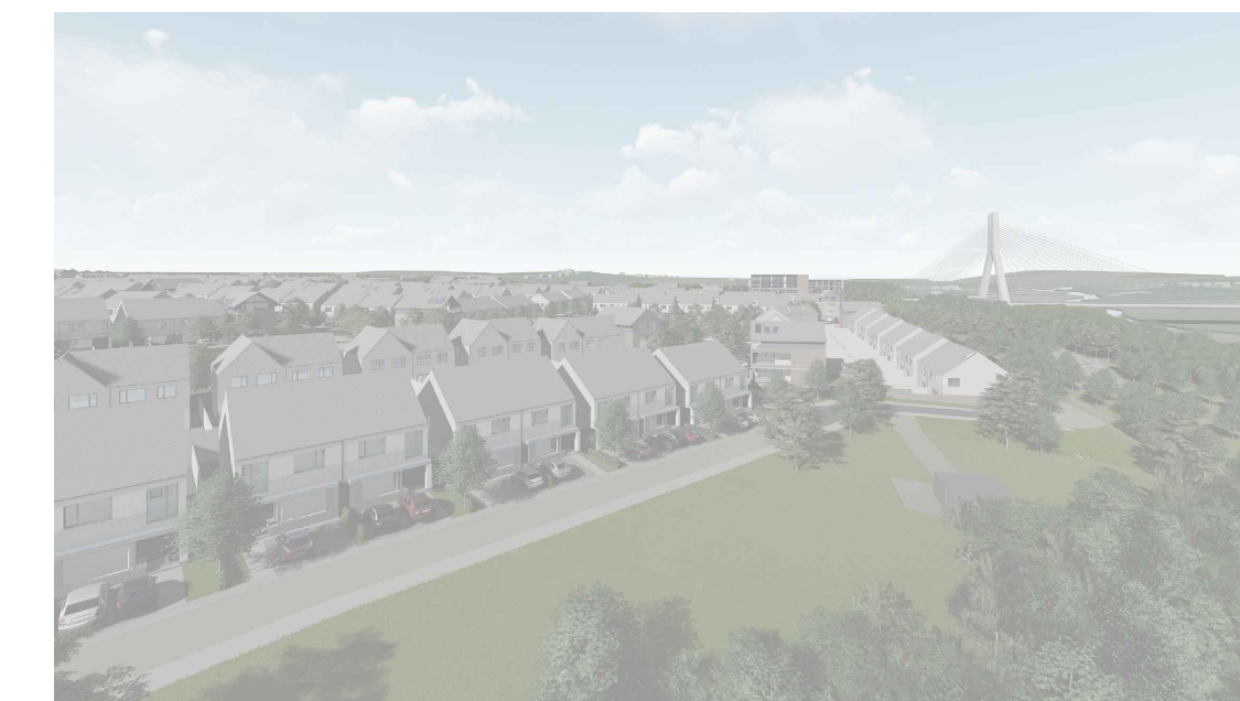
SECTION EE - VIEW 1