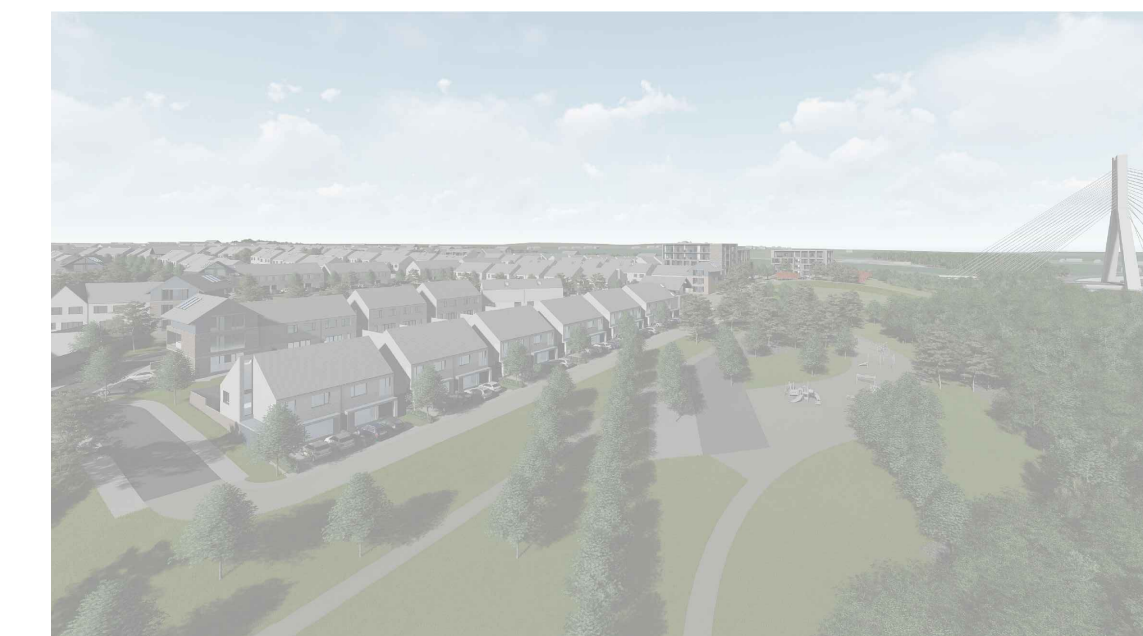
SECTION FF - VIEW 1