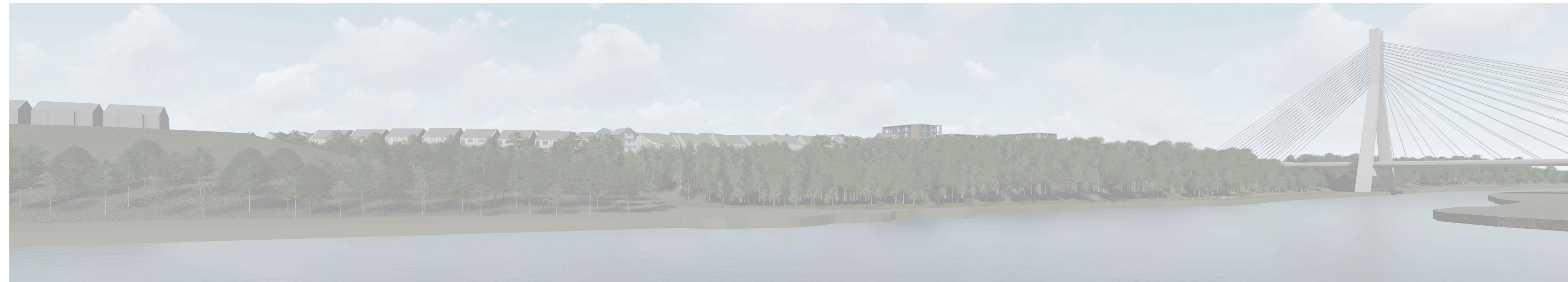
BOYNE VALLEY VIEW