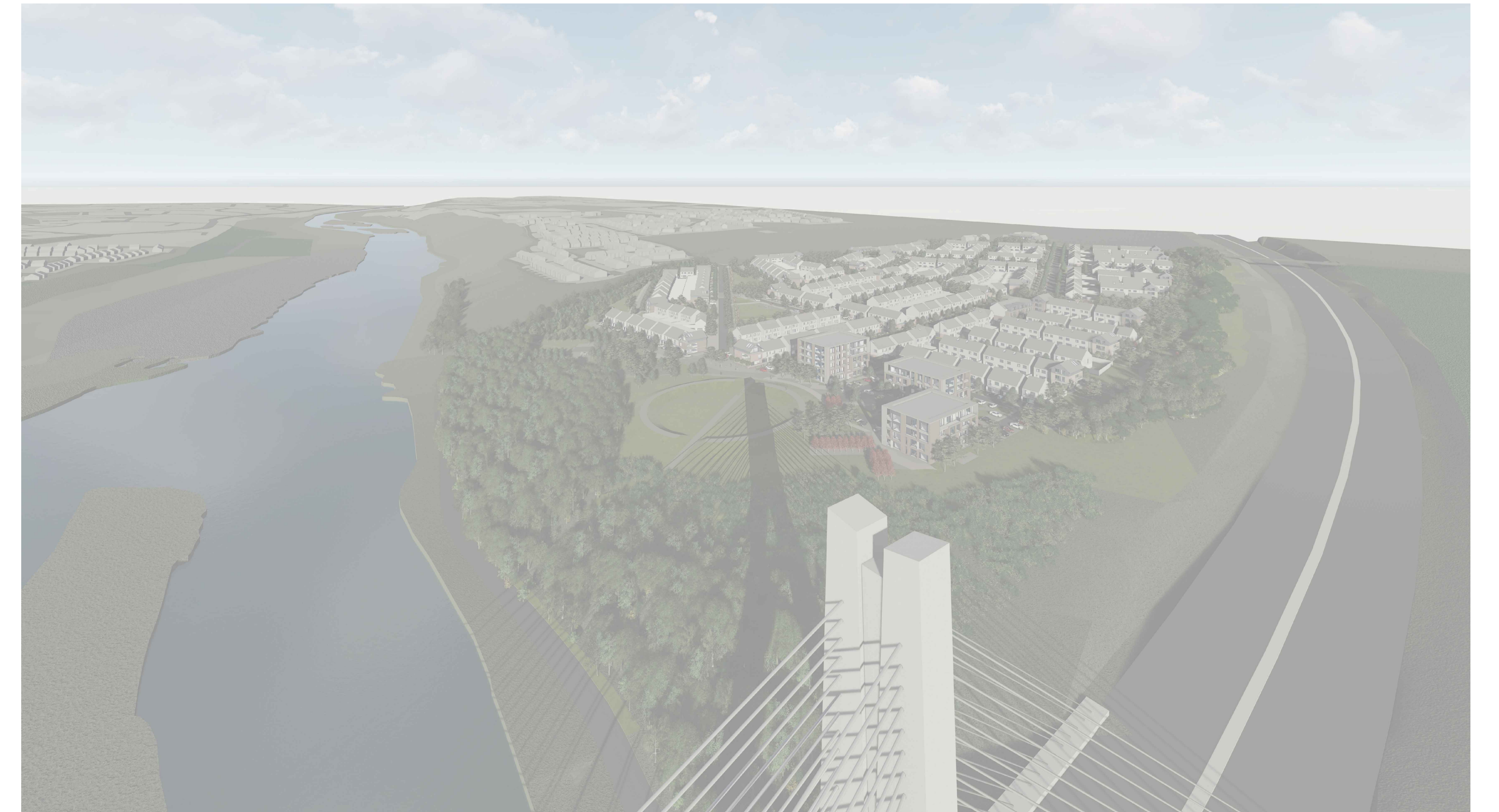
SITE VIEW FROM NORTH WEST