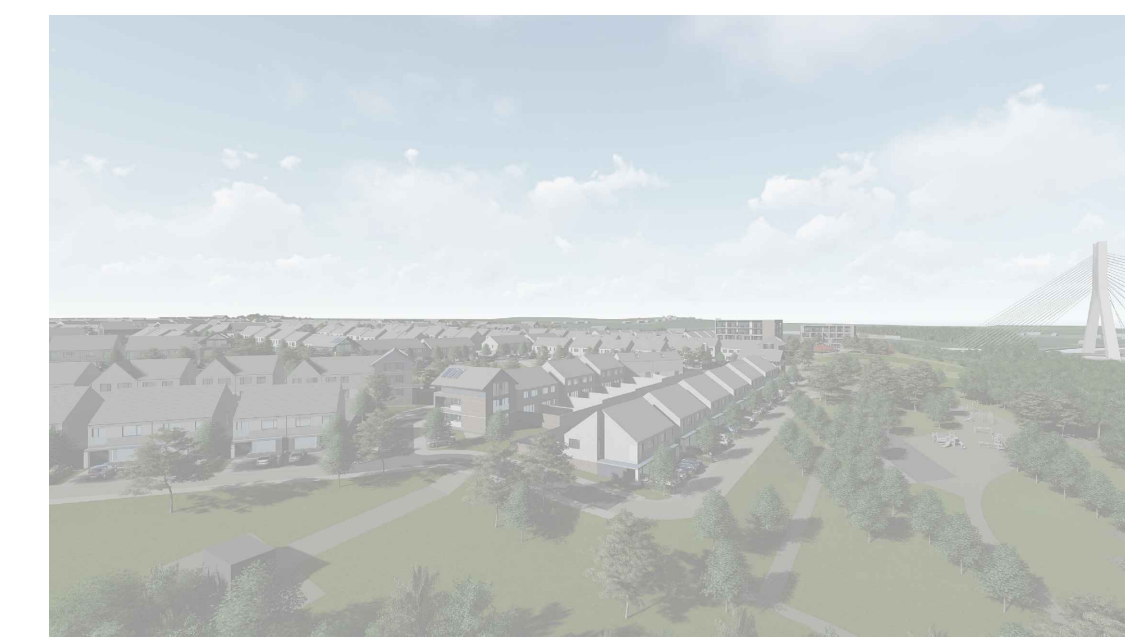
SECTION EE - VIEW 2