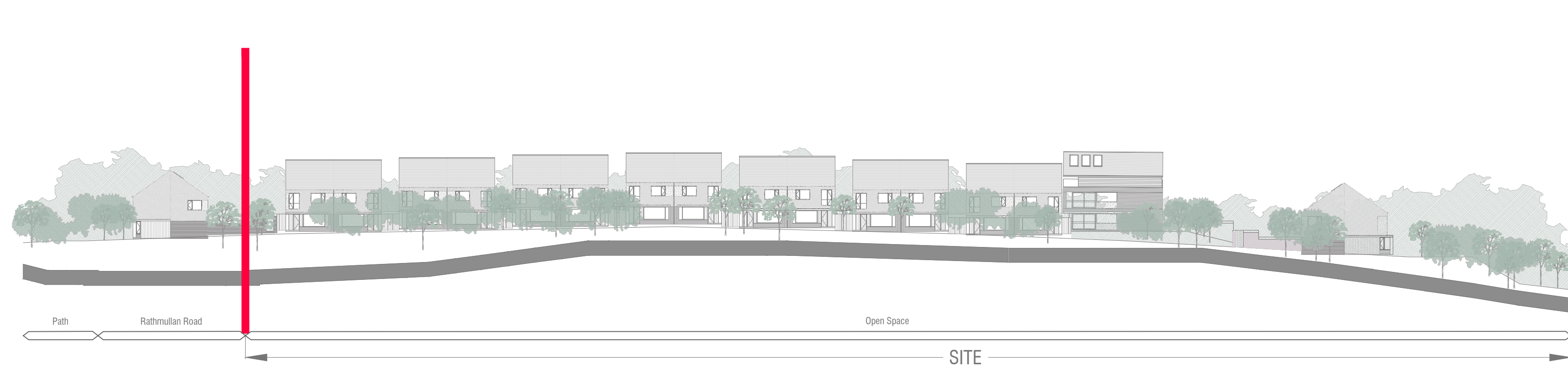
SECTION EE SCALE 1:500 @ A0