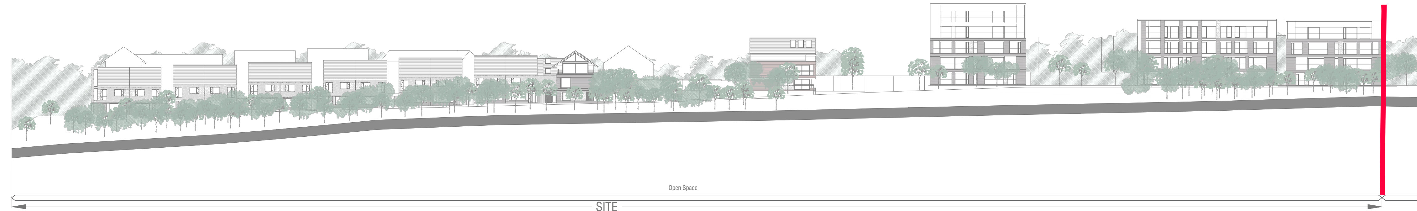
SECTION FF SCALE 1:500 @ A0