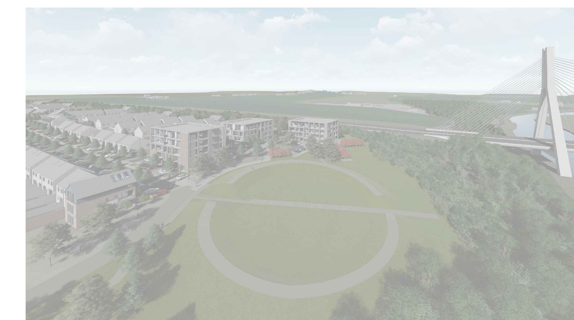
SECTION FF - VIEW 2